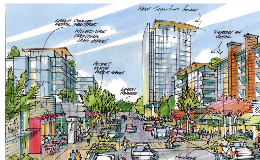
1 view of the proposed high street in the Triangle Lands Precinct.