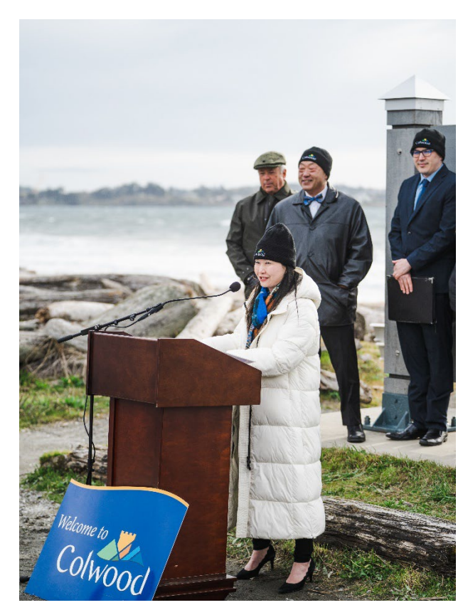
April 2023 Announcement of the $6 million Canada Community-Building Fund grant for the Waterfront Multi-use Pathway

Community Planning coordinates area planning initiatives and updates to the Official Community Plan (OCP) and other bylaws such as the Land Use Bylaw. The next major 5-year review of the OCP is anticipated to take place in 2024.